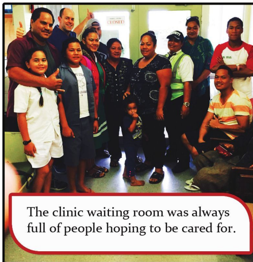
The clinic waiting room was always full of people hoping to be cared for.