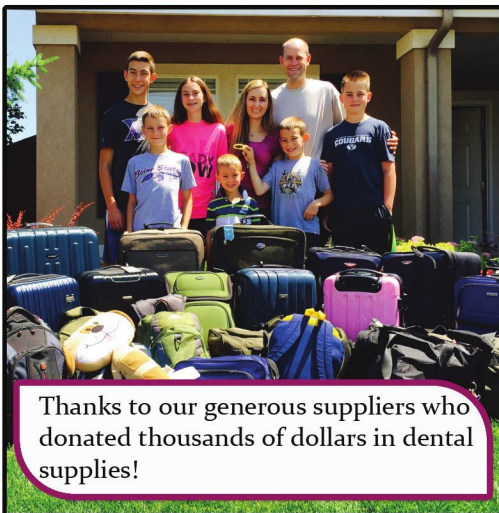
Thanks to our generous suppliers who donated thousands of dollars in dental supplies!