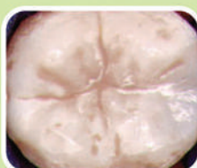
Chewing surface before sealant

Dental sealants are a great way to protect your child's permanent teeth from cavities. Dental sealants are a clear, protective coating that is applied to the biting surfaces of the back teeth. The sealant protects the tooth from getting a cavity by shielding against bacteria and plaque. Sealants are most commonly placed on children's permanent back teeth because they are more prone to cavities. The average child gets their 1st permanent molar around the age of 6. At your next dental appointment, please feel free to ask about this service that can protect your child's teeth as well as yours.