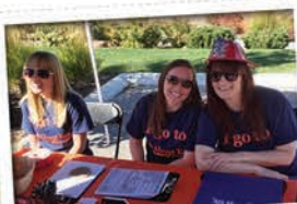
The Scheduling Trio!