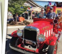
Old Fashion Firetruck!