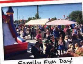
Family Fun Day!