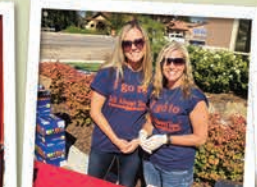
Serving Up Hotdogs!