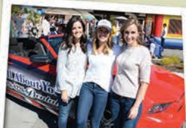
The Doctors' Wives!