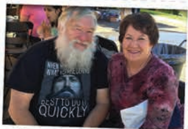
Two Happy Patients!