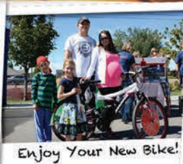
Enjoy Your New Bike!