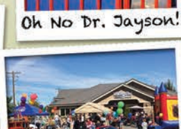
A Fun Day in the Sun!