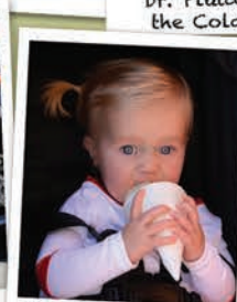
Baby Blue Eyes!