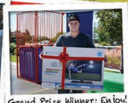
Grand Prize Winner; Enjoy!