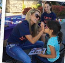
Face Painting Fun!