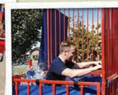
Dr. Fluid Loving the Cold Water!