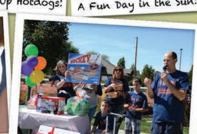
Winner, Winner, Winner!