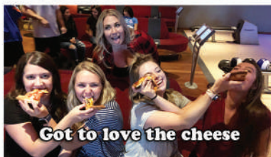
Got to love the cheese