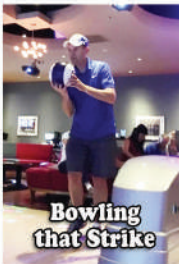
Bowling that Strike