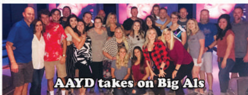
AAYD takes on Big AIs

Our All About You Dental team rocked Big Al's at our bowling pizza party. We work hard, but we play hard too!