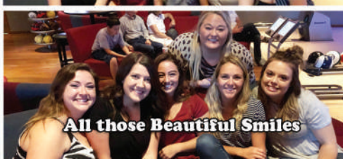
All those Beautiful Smiles