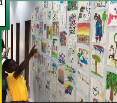
The children loved watercolor painting while waiting for a turn in the dental chair.