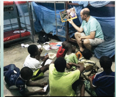
Story time at night was a hit with the orphan children.