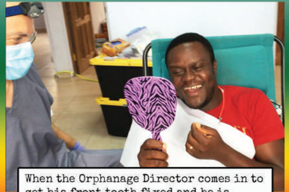
When the Orphanage Director comes in to get his front tooth fixed and he is surprised with a temporary fang instead.