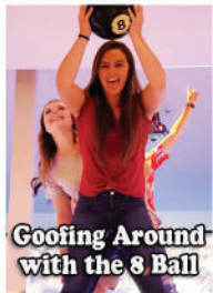
Goofing Around with the 8 Ball