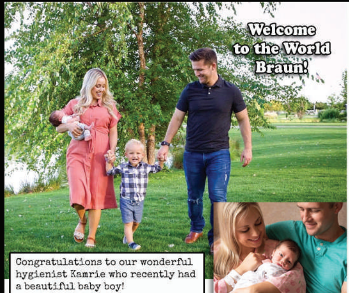
Welcome to the World Braun!