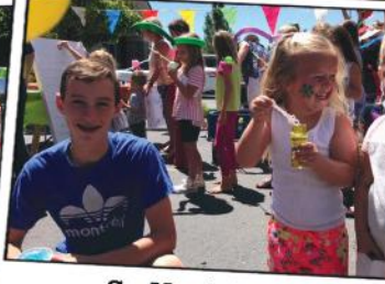
So Much Fun!