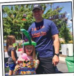
A Good Ole Book!