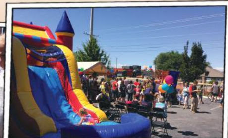
Giant Slide Fun Time!