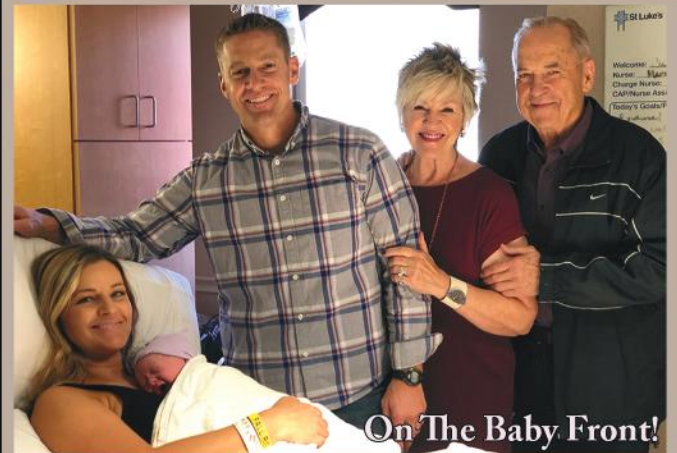
On The Baby Front!