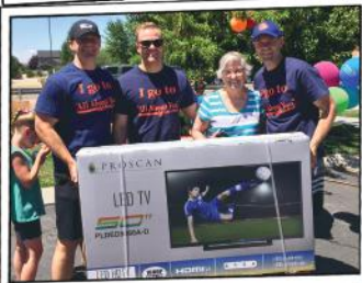
Grand Prize Winner; Enjoy!