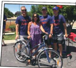
Enjoy Your New Bike!