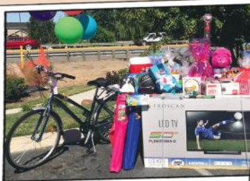
All Them Prizes!