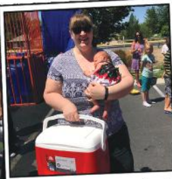
Enjoy The Cooler!