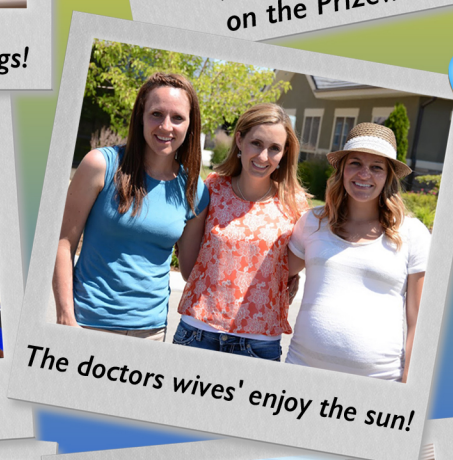
The doctors wives' enjoy the sun!