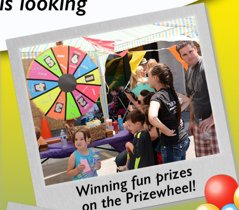
Winning fun prizes on the Prizewheel!