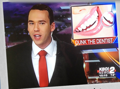
Dunk the Dentist 2014 KBOI 2