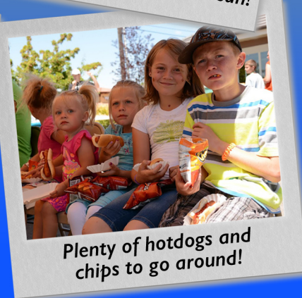
Plenty of hotdogs and chips to go around!