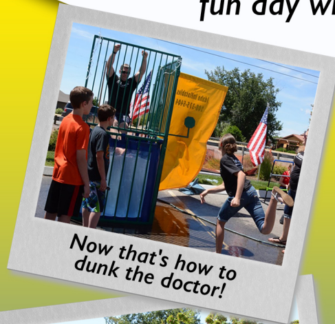
Now that's how to dunk the doctor!