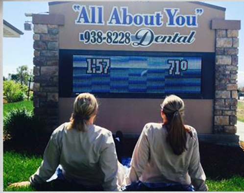
What our assistants do on their lunch breaks!

Dissolve the lemon gelatin in 1 1/2 c. liquid (pineapple juice plus water). Cream together the cream cheese, powdered sugar, half and half, and vanilla. When the lemon gelatin is cool, slowly add it into the creamed mixture. Stir in the pineapple. Pour into a mold that has been rinsed in cold water. Let set until firm. Dissolve the cherry gelatin in hot blueberry liquid. Cool, add the blueberries. Pour over bottom layer in mold and chill until set.