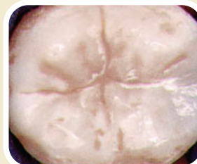
Chewing surface before sealant

Dental sealants are a great way to protect your child's permanent teeth from cavities. Dental sealants are a clear, protective coating that is applied to the biting surfaces of the back teeth. The sealant protects the tooth from getting a cavity by shielding against bacteria and plaque. Sealants are most commonly placed on children's permanent back teeth because they are more prone to cavities. The average child gets their 1st permanent molar around the age of 6. At your next dental appointment, please feel free to ask about this service that can protect your child's teeth as well as yours.