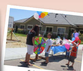
Spin To Win!