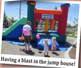
Having a blast in the jump house!