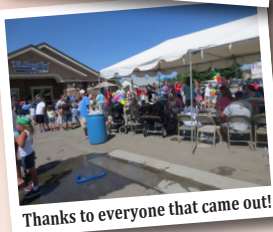
Thanks to everyone that came out!