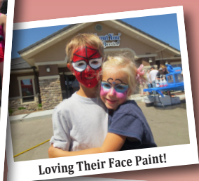
Loving Their Face Paint!