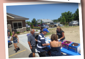
Enjoying some food!