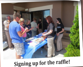
Signing up for the raffle!