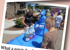
What a great day for a snow cone!