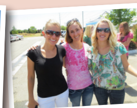
The doctors wives enjoying the day!