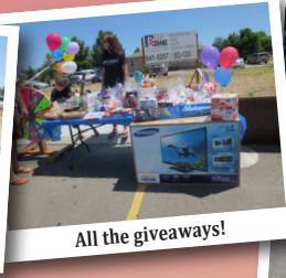
All the giveaways!