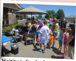
Waiting in line for face painting!