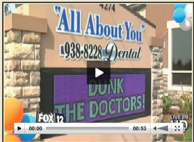
New Office Patient Appreciation Open House--Summer, 2011