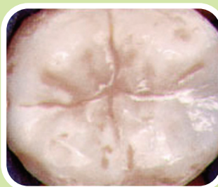
Chewing surface before sealant

Dental sealants are a great way to protect your child's permanent teeth from cavities. Dental sealants are a clear, protective coating that is applied to the biting surfaces of the back teeth. The sealant protects the tooth from getting a cavity by shielding against bacteria and plaque. Sealants are most commonly placed on children's permanent back teeth because they are more prone to cavities. The average child gets their 1st permanent molar around the age of 6. At your next dental appointment, please feel free to ask about this service that can protect your child's teeth as well as yours.